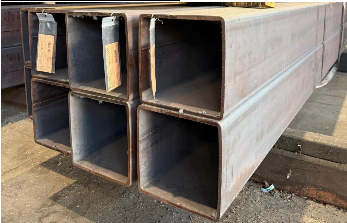
Figure 1: visual representation of the product